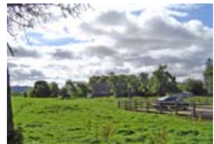
Large trees remain at Newbigging towards the doocot (above) and the odd remnant survives on the south side of Grange Pow (below)