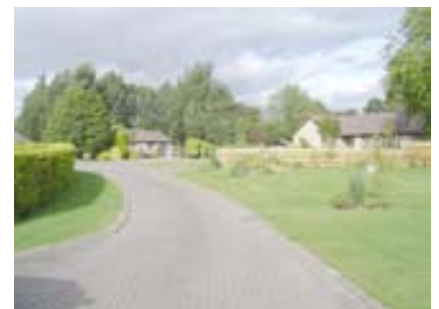
Part of Gourdiehill orchard site cleared for housing in 1989