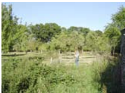
The entrance above the walled gardens (above), significant numbers of trees still exist (below)