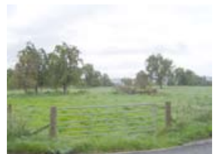
Grange is large and nowadays open