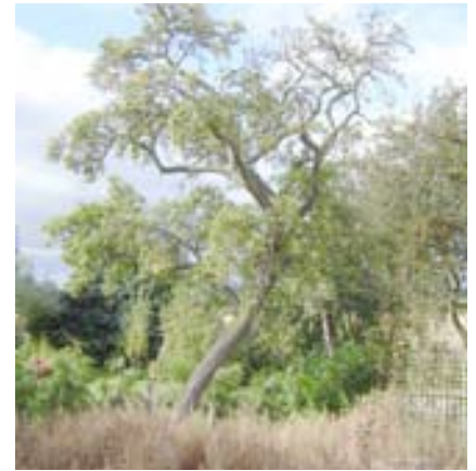
The last of ten thousand: a pear