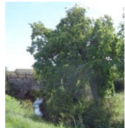
Clear lines of trees still exist at Port Allen (below)