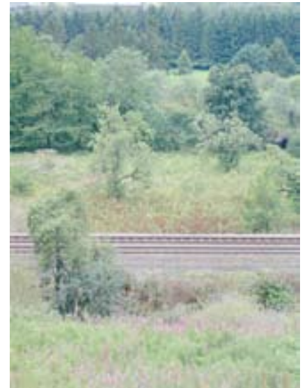
The orchard at Barnhill Toll mainly survives on the strip between the railway and the River Tay.

Apple trees lost by cattle removing bark. Owner said that old varieties had been collected by Mylnefield SCRI before this