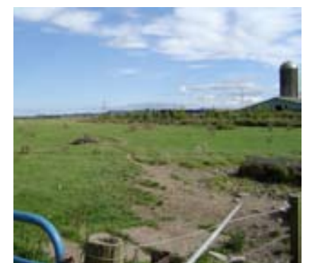
Looking down across former orchard site, partly lost to expansion of farm buildings